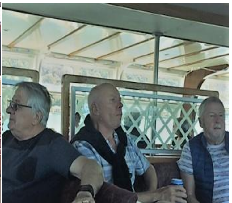
Three old salts just waiting for shore leave

A Christian is a man who feels repentance on a Sunday for what he did on Saturday and is going to do on Monday. Thomas Ybarra